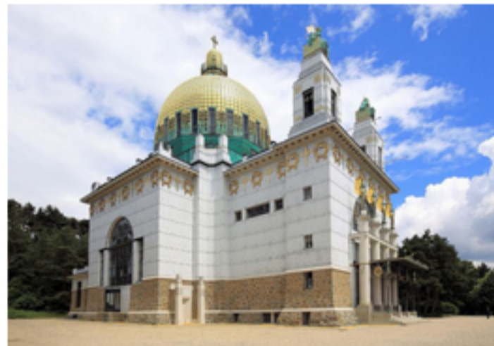
Kirche am Steinhof