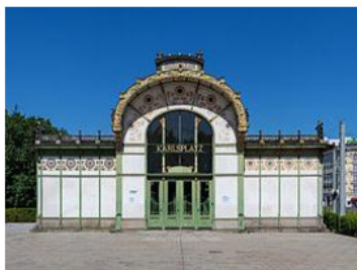
Karlsplatz Stadtbahn Station

Photo copyright © Thomas Wolf / CC-BY-SA 4.0