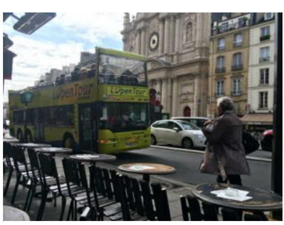
"April In Paris" with the Eiffel Tower and the "Hop-On Hop-Off" L'Open bus tour.